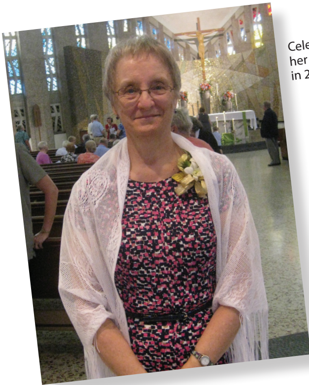
Celebrating her Jubilee in 2014.